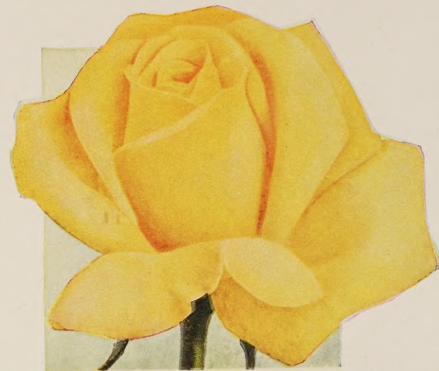
LOWELL THOMAS (Pat. 595)